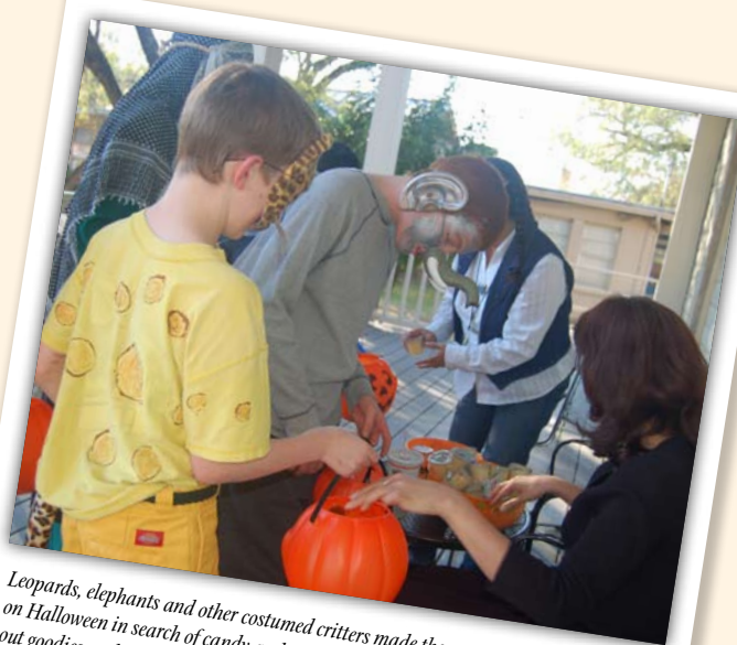
Leopards, elephants and other costumed critters made the rounds of the MRM campus on Halloween in search of candy and treats ... and the MRM staff cheerfully handed out goodies and goodwill.