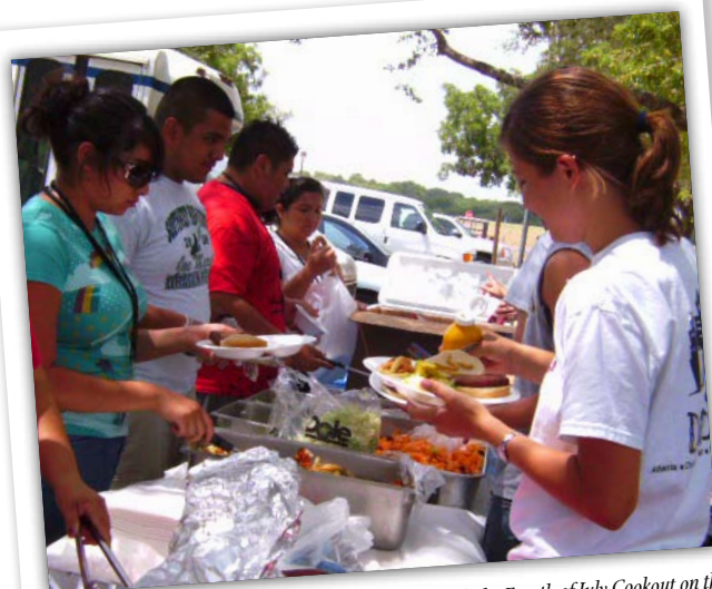
Teenagers from Family Service Association assist with the Fourth of July Cookout on the Mission Road campus.

First, we've got the spirited, delightful and challenging residents of Mission Road — kids whose medical, mental and physical challenges make it necessary to tailor camp activities to meet them where they are. Then stand back and be amazed at the joy.