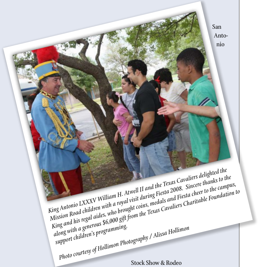
San Anto- nio