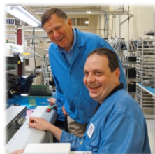
Job Coaches are the Key to Success

KEEP: Job coaches provide ongoing support to both our clients & their supervisors throughout the entire tenure of the job.